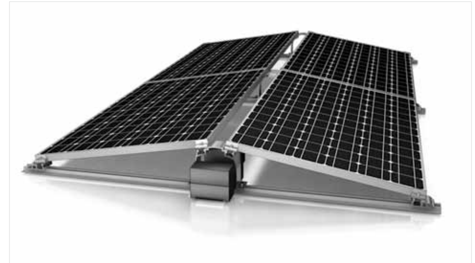
Detail illustration - D-Dome System